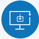
External Software Publications