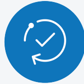
Repository Commits & Testing