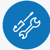
In-House Tools & Applications