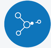
Product / IoT Software Security